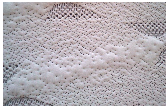
Blizzard Removable Cover

Also, Harvey Norman sells the Sleepmaker Innergetic (latex) and the Nassau, which are similar to Town & Country mattresses.