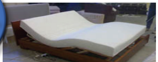
Euro timber stained King size

Electric & Manual adjustable beds are GST exempt!